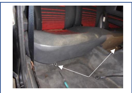
Remove the rear seat base by undoing the 2 screws either side.