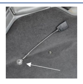
Then remove the bolt from your seat belt mount on either side of the tunnel.