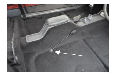
Then locate the seat belt holes in the tunnel, again make a hole in the carpet big enough to fit the bolt through. The seat belts can now be screwed into place.

Find the insertion holes for the front seats and create a hole for the bolts. There is two on the front and two on the back.