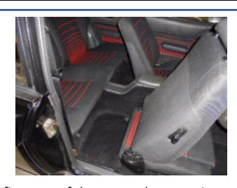
The first part of the removal process is to remove your seats. Firstly move your seat forward and remove the two 10mm bolts then move the seat back and remove the front two bolts, the seat can now be taken out of the car.