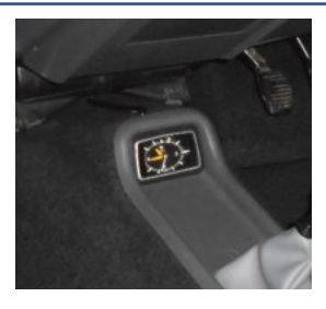
Next refit the clock mount using the two screws removed earlier and also press the wires back into the clock and refit into the hole.