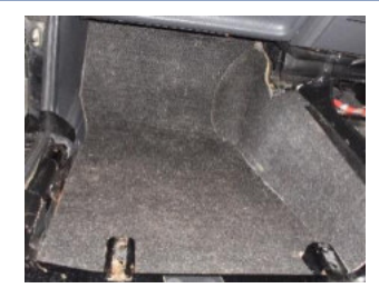
The same can now be done with the passenger's side front footwell underfelt. Make sure you are happy with the placement on both sides and glue them down.

Place the drivers side mat from number 4 into the car and trim back the felt to clear the pedal assembly. Furthermore where the underfelt overlaps on the tunnel section mark and cut to allow the underfelt to sit flush.