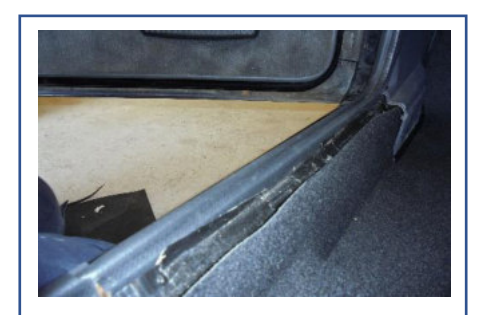
Trim the carpet down around the sill so it is in line with the top of the sill, and glue.