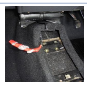
Using the Velcro pad stick down the carpet onto the top of the clock mount.