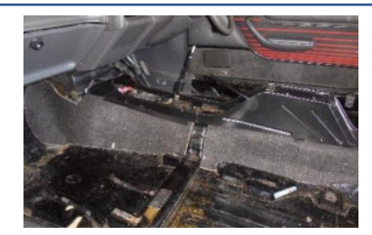
You can now refit the metal center console. (please note this is for the mk2 only)