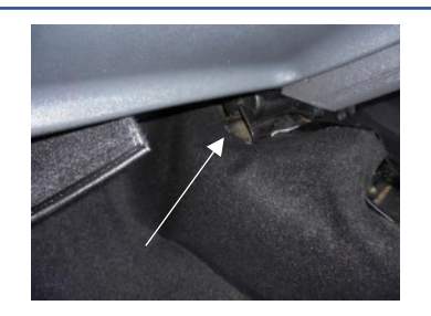
Feed the carpet in and under the heater matrix.