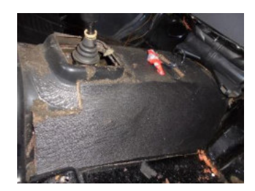
The tunnel section will be the last piece of underfelt remaining and should pull straight out with nothing else needing to be done.