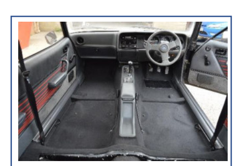
The carpet has now been fully fitted!