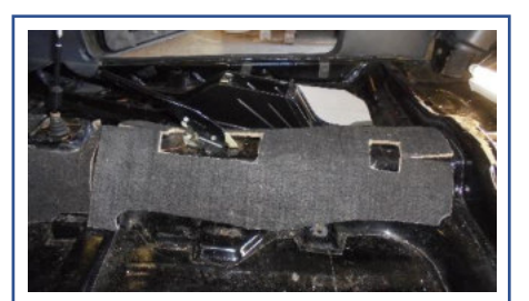
Secondly use number 2 – the rear tunnel section. Line up the cuts in the underfelt along with the tunnel and glue down.