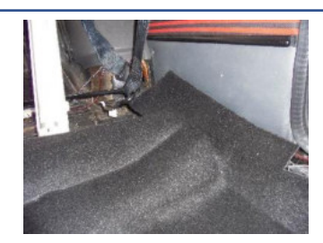
Tuck the rear section under the rear quarter panel and if needed trim back to clear wiring loom / speaker wires, when happy with the finish, spray and glue down.