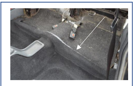
Next is to glue down the rear edge.