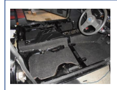
Above is a fitted picture of the underfelt.

Please note - The picture is an mk2 underfelt, the mk1 will have no cut outs in the tunnel section.