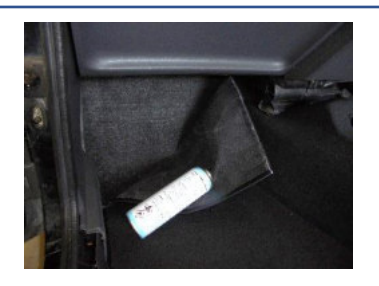
You can now start to glue down the carpet, start at the front end near the foot well.