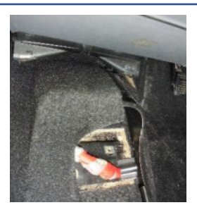
Then glue down the area around the clock mount.