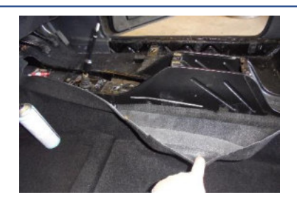
Work your way down the tunnel making sure you cover both the tunnel and carpet evenly. At this point do not fold the carpet over the tunnel.