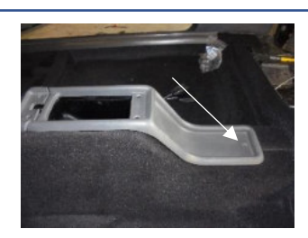
The rear section of the console can now go back in, however only fasten the back screw, the blanking plug can be refitted on top.