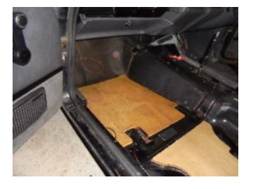
Now the carpet has been fully removed we can focus on removing the underfelt. Remove all of the pieces on the floor first.