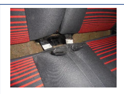
Pull the belts through there slots and the base is now free to come out of the car.