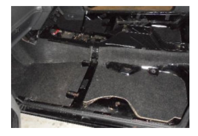
Pieces number 5 – the rear floor well sections, can be laid into place on the floor well and glued in. Minimal trimming if any is needed.