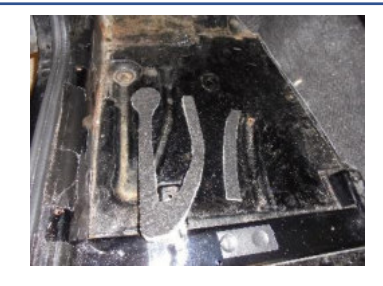
Use part's 3 – the floor filler felt to fill in the pressings pressed into the floor pan. These can be glued in place on their respected sides.