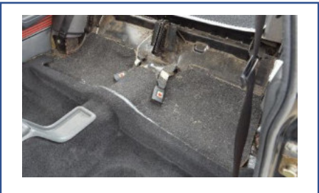
The rear seat base section can now be glued down into place.