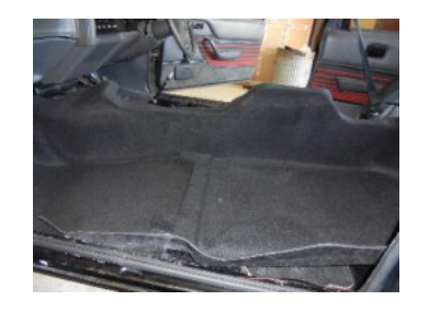
Starting with the passengers side first, lay this segment into the car.