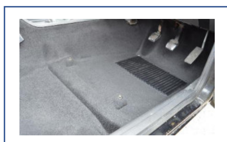
Next you will need repeat all of these steps for the right hand side piece.

Turn your focus now to the tunnel area, firstly pull back the carpet over the tunnel and glue, secondly using a hair dryer or heat gun gently heat up the back of the carpet to allow for you to turn the carpet over the top of the tunnel. Any excess material can be trimmed off.