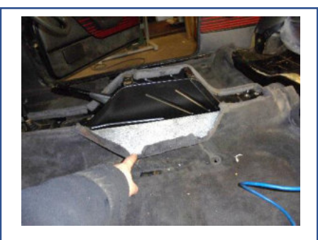
Peel back the carpet over the top edge of the center console.